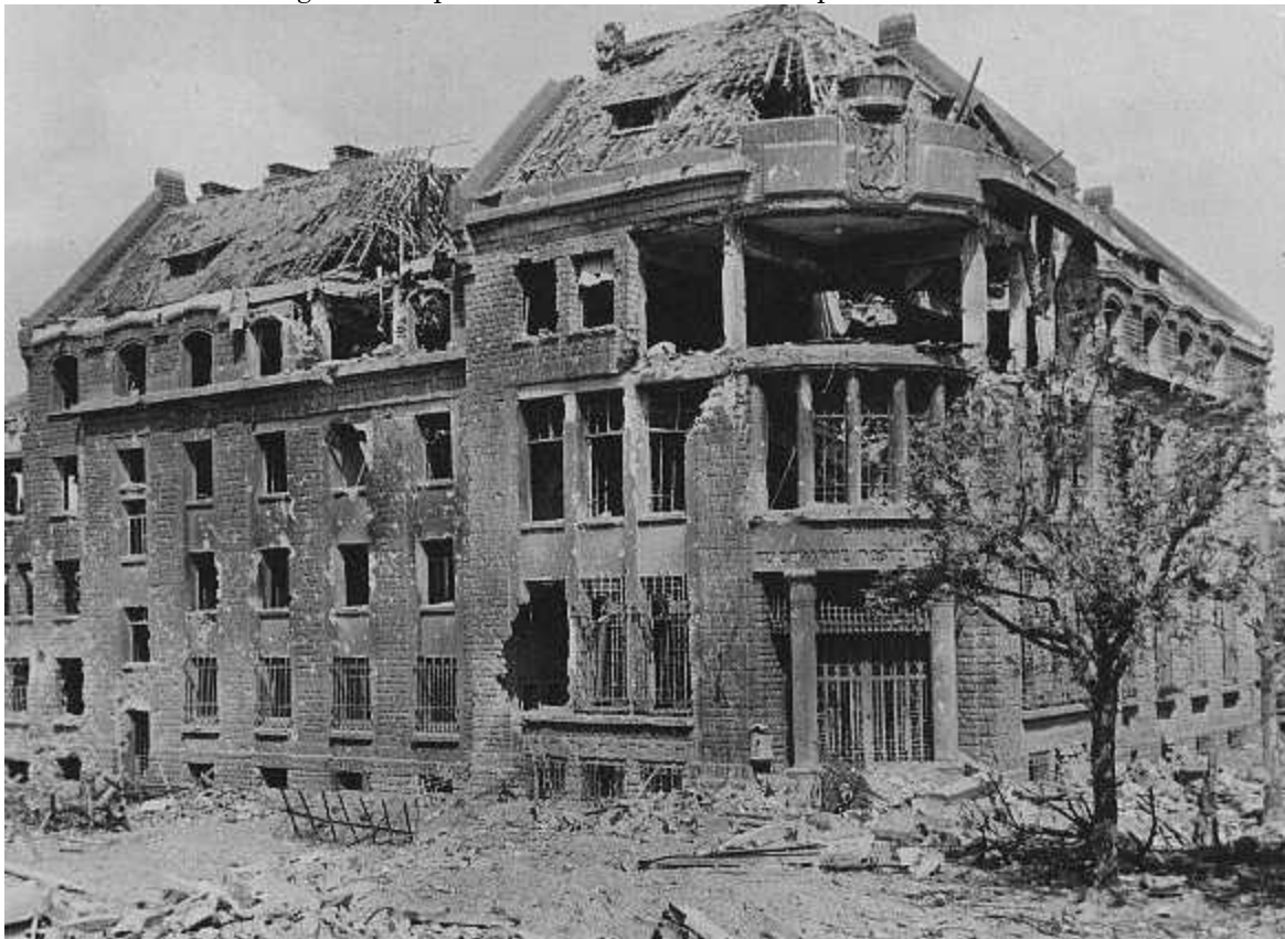
A BLASTED-OUT HUSK OF A BUILDING FOLLOWING THE MOST RECENT CoR ATTACKS IN EUROPE

Apostle Gives Order to March into New Theatre of War—Copenhagen Falls Soon After German Radio Message Intercepted in London Confirms Reports—Cruisers Enter Danish Port