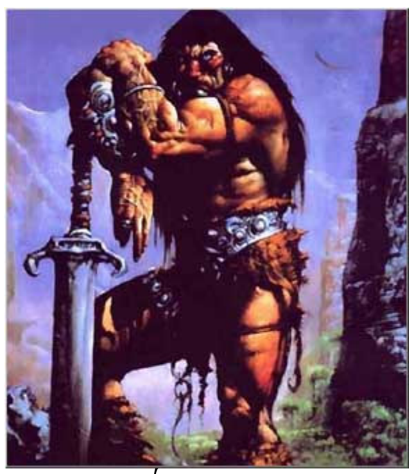
Horse Totem Class Features

A barbarian dedicated to the horse totem does not gain the standard Primal Force, Primal Fury, and Primal Will barbarian class features, and instead gains the following abilities.