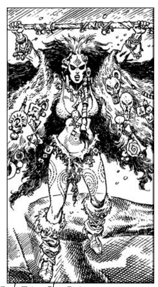
Eagle Totem Class Features

Frightful Presence: This special quality makes a creature's very presence unsettling to foes. It takes effect automatically when the totem warrior performs some sort of dramatic action (such as charging, attacking, or snarling). Opponents within range who witness the action may become frightened, and must flee if possible. If fleeing is not possible, the opponent suffers -2 to all actions while in the presence of the totem warrior. This ability functions with a range of 30 feet, and the duration is equal to 1d6 rounds, plus the totem warrior's barbarian class levels. This ability affects only opponents with fewer Hit Dice or levels than the creature has. An affected opponent can resist the effects with a successful Wisdom check (CC = 1/2 the totem warrior's level). An opponent that succeeds on the saving throw is immune to that same totem warrior's frightful presence for 24 hours.