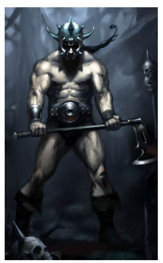
Bear's Fortitude: A bear-totem warrior gains +1 to all Constitution-based Saving Throws to resist disease, poison, and fatigue. This bonus increases to +2 at level four, to +3 at level eight, and to +4 at level twelve.

Bear Hug: A bear-totem warrior gains +2 to all attempts to grapple an opponent, or maintain a pre-existing grapple. This bonus increases to +3 at level four, to +4 at level eight, and to +5 at level 12. So long as the bear-totem warrior has an opponent grappled, he may automatically deal 1d6 damage, plus his strength bonus, each round as he squeezes the opponent.